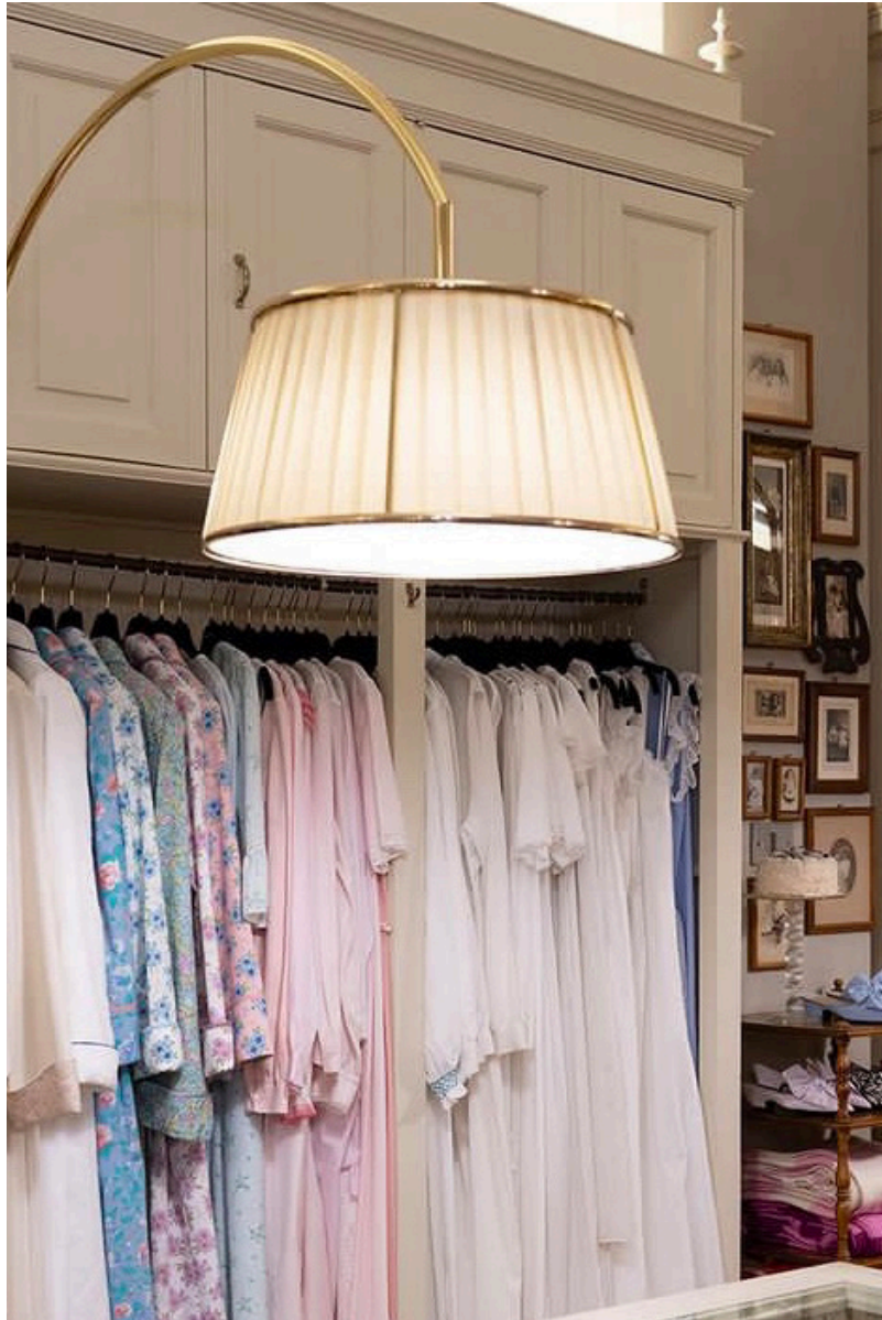
Photo / Loretta Caponi's Flagship